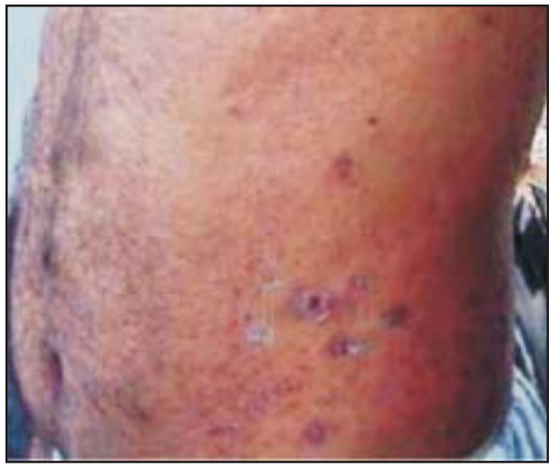
Eschar of tick bite over the left side of the abdomen

R.typhi and R.prowazekii are closely similar but may be differentiated by biological and immunological tests. When male guinea pigs are inoculated intraperiotoneally with blood from