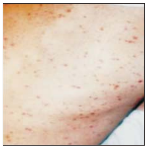
Maculopapular rash on back of a case of scub typhus

However, investigation may reveal early lymphopenia with late lymphocytosis. Albuminuria is a common laboratory finding. Thrombocytopenia is observed in more than half of the patients with epidemic typhus.